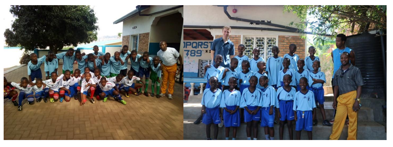
Happy boys and girls, learning so much about themselves and teamwork.