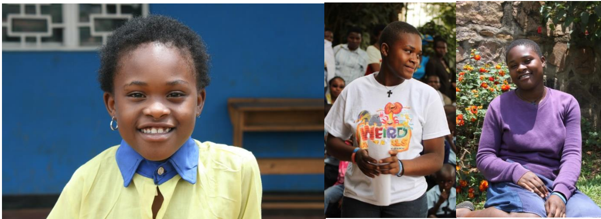
One of our sport stars who has been invited to train with the Rwandan cricket squad.